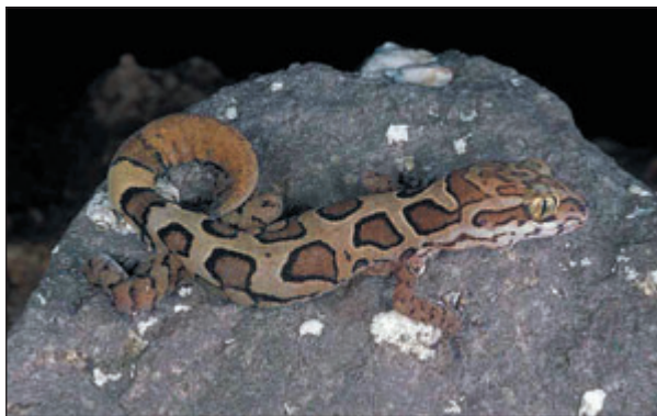
Fig. 2. Adult Geckoella cf. collegalensis from Toranmal, Dhule district, Maharashtra, India.