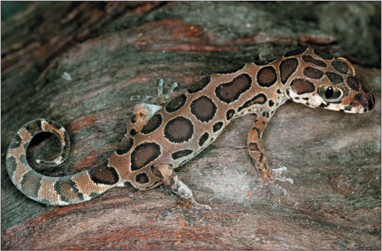
Fig. 1. Adult Geckoella cf. collegalensis morph 'collegalensis' from Aarey Milk Colony, Maharashtra, India.

bai, Maharashtra); BNHS 1392 from Calicut University Campus, Kerala; BNHS 1434 Gir Forest, Gujarat and BNHS 1675 from Kalakad — Mundanthurai Tiger Reserve, Tamil Nadu. This species is listed as Data deficient (Molur and Walker, 1998) and the information about the habitat, natural history and morphological variation is meagre, thus in the present communication we take the opportunity to add some data from the newly acquired as well as observed specimens and the older museum material in Mumbai. The paper also presents a review of its distribution based on specimens examined, literature reports and reliable photographic evidence and also provides information on the natural history and habitat preference of this poorly known gecko. Earlier publications pertaining to this species have been restricted in providing new locality records and a single one on its ecology (example Vyas, 2000; Gupta, 1998; Saker, 1994; Prasanna, 1993). The two color morphs were relegated to a subspecific level which were later considered as synonyms (Smith, 1935); but yet there has been no considerable work done on the color morphs and the possibility of further taxonomic revision into consider-