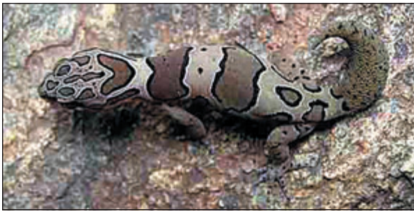
Fig. 4. Geckoella cf. collegalensis morph 'specious' from Bandipur Tiger Reserve, Karnataka.

mealworms and spiders. On certain occasions the gecko would devour 25 to 30 termites at a time. Six more specimens were collected from Aarey Milk Colony between March and May 2008 and kept together in a wooden box and were provided with the same diet which was readily accepted by all specimens. No sign of aggression was observed among the geckos. The geckos would actively forage and pursue its prey. Water was offered every alternate day and was accepted. The geckos would hide under a bark piece provided for shelter during the day and would be active at dusk as observed in the wild. One of the captive geckos laid two eggs in the month of May (eggs did not hatch, probably infertile) and was gravid in another two weeks as the developing eggs were evident in the body cavity. This proves that this species might lay more than one clutch in a single season. All the captive geckos were released after photography and observations at the collection site. Our observations of this species being strictly terrestrial are at odds with that of Tikader and Sharma (1992) who regard this species to be arboreal.