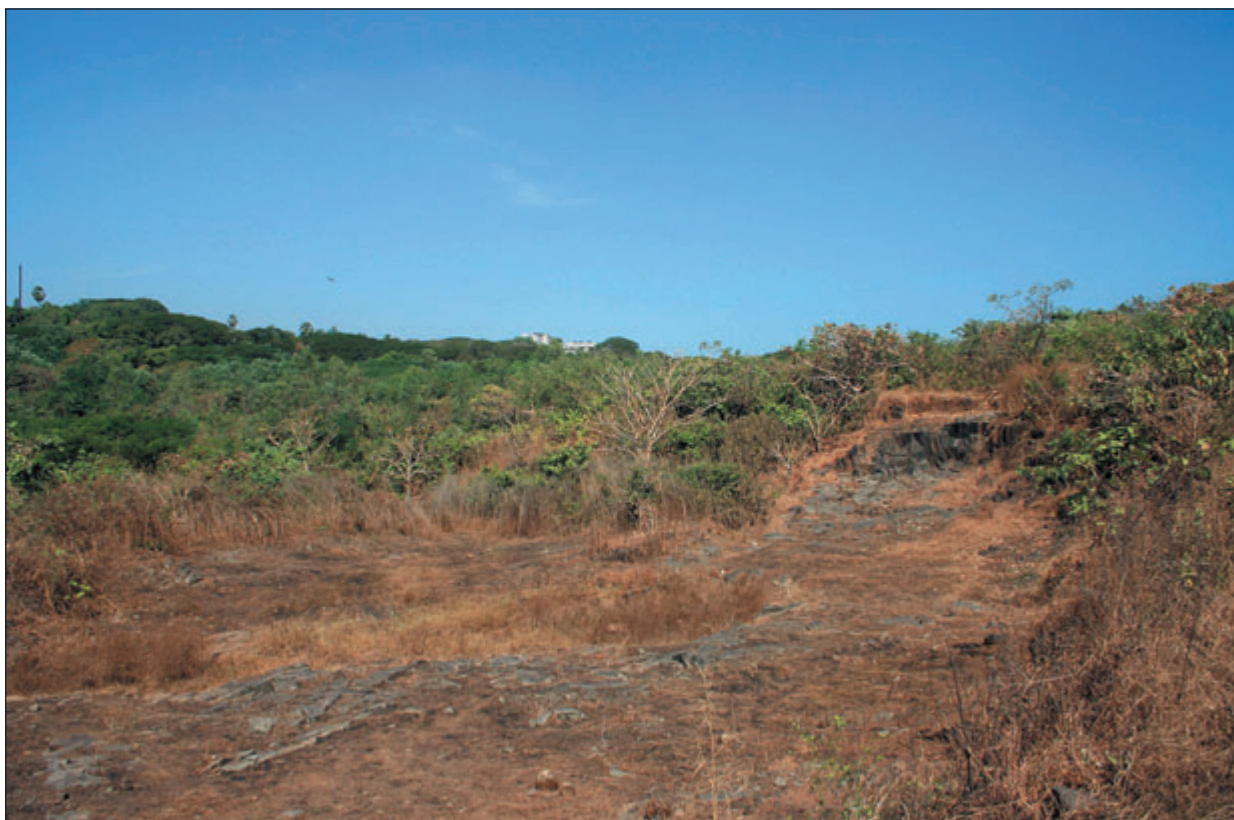
Fig. 6. View of habitat of Geckoella cf. collegalensis from Aarey Milk Colony, Mumbai, Maharashtra, India.