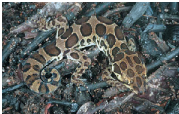
Fig. 3. Adult Geckoella cf. collegalensis from Chandrapur, Chandrapur district, Maharashtra, India.